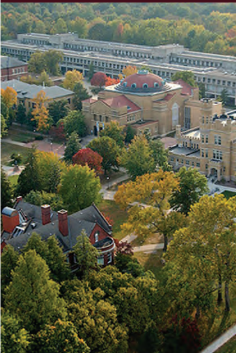
SIU CAMPUS | CARBONDALE, IL